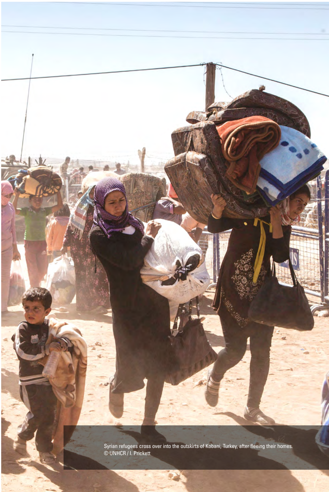
Syrian refugees cross over into the outskirts of Kobani, Turkey, after fleeing their homes.