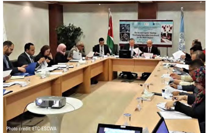
Session of the EGM in Amman on 19 and 20 March 2015

While all countries in the Middle East and North Africa (MENA) region recognize the importance of innovation on the road to the knowledge economy, an articulated understanding of national innovation systems is still lacking, and little data are available on countries’ capacities and performances in innovation. The European