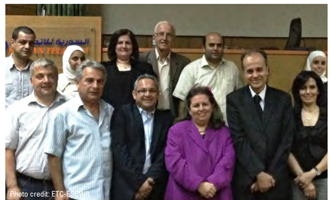
Participants in the AIGLE workshop held in July 2015 in Syria

In the Syrian Arab Republic, two advisory missions were implemented within the AIGLE project, from 26 to 29 July and from 30 August to 2 September, to contribute to capacity-building workshops on ICT for development. The training modules 1 and 3 of the AIGLE project were presented and discussed. Presentations also tackled strategies and e-government applications in the Arab region. The first workshop was dedicated to officials from the Ministry of Communication and Technology and attended by more than 30 trainees from several public institutions. The second workshop targeted the Ministry of Local Administration staff and was attended by more than 15 trainees.