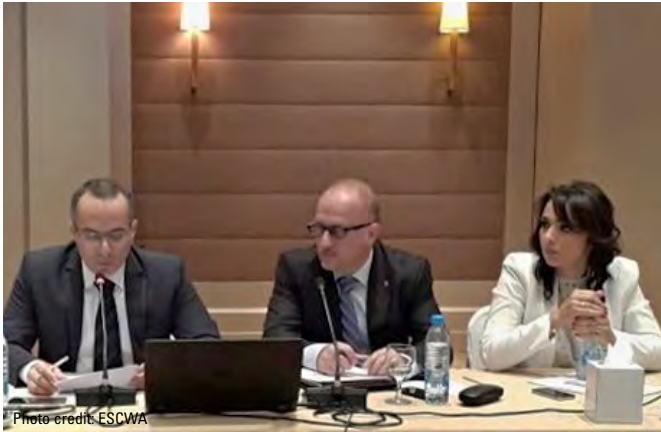
Discussion during the 9th AMAG Meeting in Beirut, September 2015

The draft programme for AIGF-IV was prepared, based on the experiences and lessons learned from the previous annual meeting, and the various AMAG working groups were briefed on progress made in the preparation for the forum. Two new working groups were formed to work prepare the AIGF-IV catalogue and the preceding capacity-building workshop.