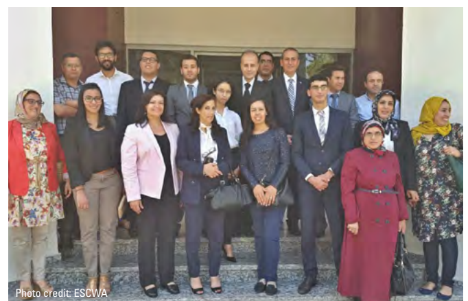
Participants in the workshop held in Morocco

Upon the request received from the Ministry of Trade, Industry, Investment and Digital Economy, a mission was carried out by TDD, in coordination with the ESCWA Statistics Division, from 6 to 8 October to conduct a workshop on ICT indicators and the Moroccan ICT business survey, in coordination with the Statistics Division at ESCWA. Suggestions and comments were made to update the survey. More than 15 participants from the Ministry and other national entities attended the workshop and actively contributed to discussions about ICT indicators and surveys. During the workshop, ESCWA presented best international and regional practices in the subject matter.