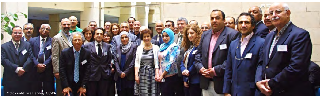
Speakers during the EGM in Jordan on 3 and 4 June 2015

The meeting resulted in recommendations on priority areas for future work and possibilities for knowledge-sharing and transfer among countries. Experts also stressed the need to clearly identify the innovation system and ecosystem, and to analyse their status in the Arab region and in individual countries.