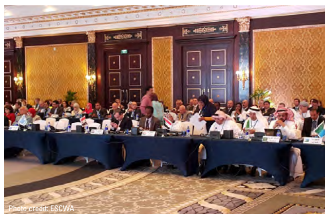
Some attendees at the AFSD

The third annual Arab Forum for Scientific Research and Sustainable Development took place in Beirut from 10 to 12 December. It was jointly organized by the Arab League Educational, Cultural and Scientific Organization (ALECSO), ESCWA and the Hariri Foundation, in collaboration with the General Union