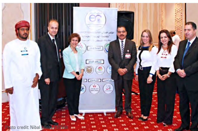
Some participants during the conference on cybercrime

The Second International E-Commerce Conference on Combating Cybercrimes was held in Salalah, Oman, on 25 and 26 August. The Oman Chamber of Commerce and Industry Salalah branch and