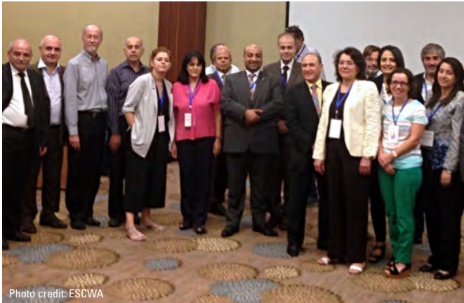
Participants in the meeting on the Med-Dialogue Project.

implementing the SDGs in the draft common ICT vision of partner countries.