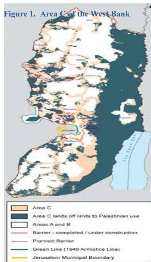
Figure 1. Area C of the West Bank

On 29 November 2012, pursuant to General Assembly resolution 67/19, 2 Palestine was granted non-Member Observer State status at the United Nations. However, the political and security situation remained highly volatile. The ongoing Israeli occupation and violations of international humanitarian and human rights law have resulted in a protracted humanitarian crisis, slowing progress on women's civil, political, social and economic rights. During the reporting period, efforts by the international community to encourage a resumption of negotiations between the Government of Israel and the Authority on a final status