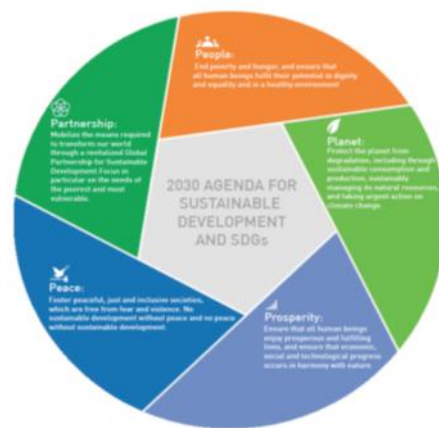
Figure 1: The five P's